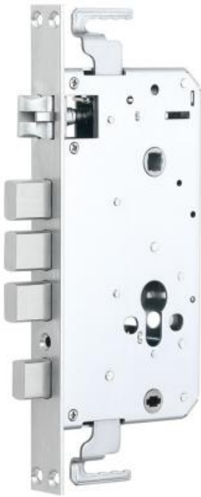
Standard lock body

Locks specially designed for narrow-edged doorframes